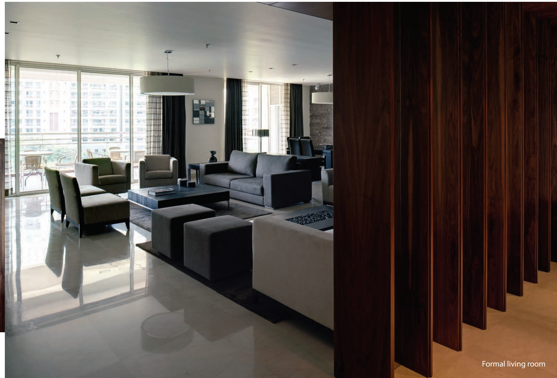
Formal living room