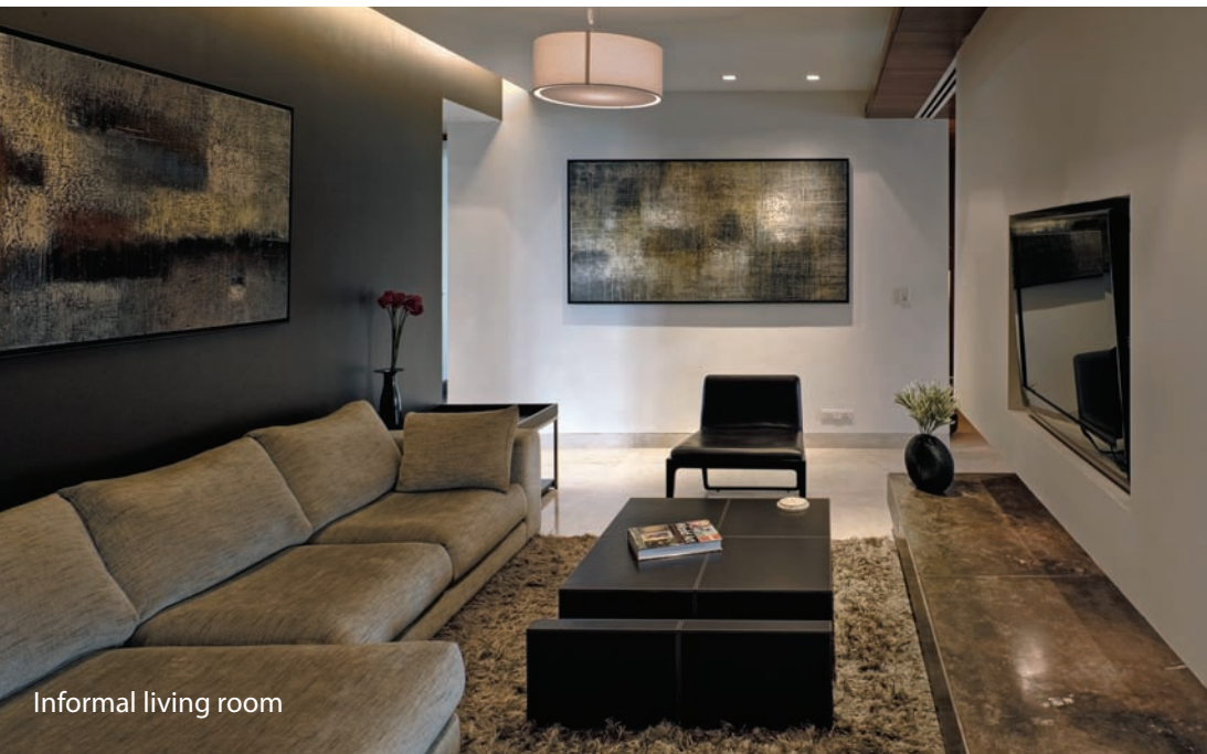
Informal living room

is the study which can also be used as a TV room or even a home office. The study has imported hard wood flooring and ample storage space for personal effects and shelving for the LCD TV and books. The study, next to which is a convenient powder room, also overlook the golf links to the south with sliding doors that open out onto the large covered balcony.