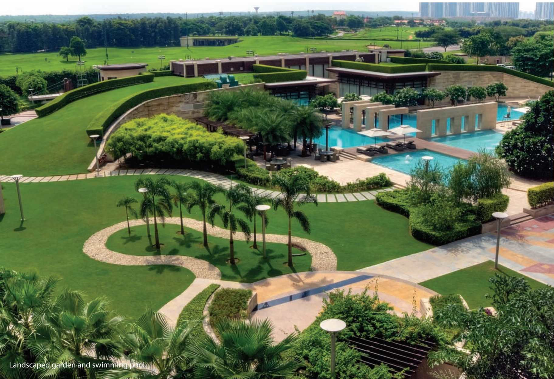
Landscaped garden and swimming pool