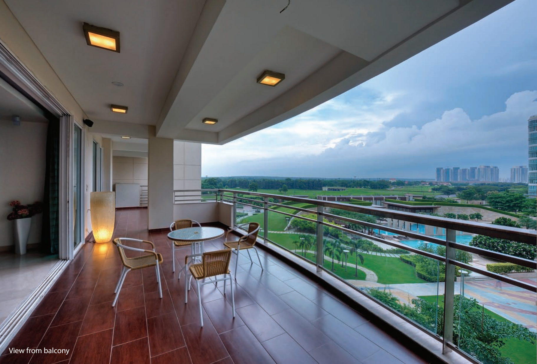
View from balcony