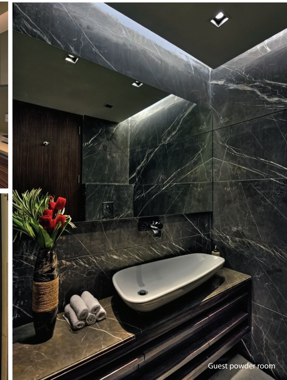
Guest powder room